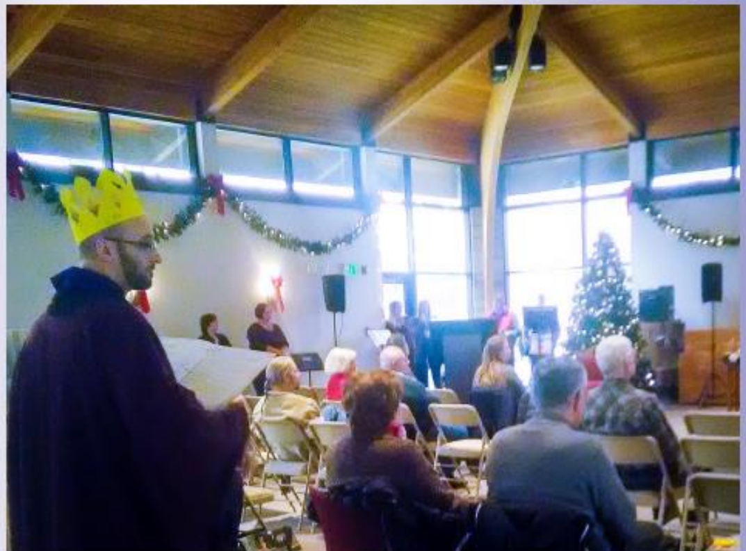
Just A Little Christmas — Sunday School Christmas 2017