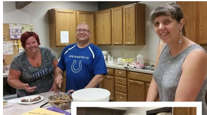
God’s Work, Our Hands & Rally Day!